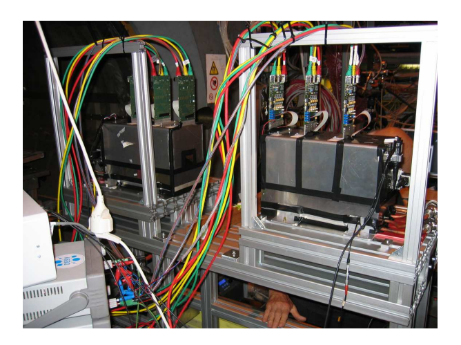
Fig. 2. Mechanical concept of the telescope.

It is foreseen that the beam telescope will be operated in widely varying R&D applications with very different DUTs. The telescope provides six telescope reference planes for redundancy and flexibility. For large DUTs mechanical actuation is foreseen in order to move the device through the active area of the telescope. The telescope is subdivided into two arms to allow more flexibility without limiting the size of the DUT which will be located between the two arms. In Fig. 2 the telescope is shown as it was installed at the SPS testbeam at CERN in summer 2007. Three sensor jigs (L-piece) are positioned on a track system. The minimal distance between the first and the third layer is 2 cm, the maximum level arm of each sensor are is 15 cm. Each L-piece holds one proximity